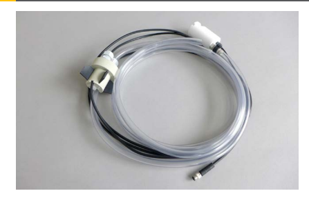
Universal level control 1005098